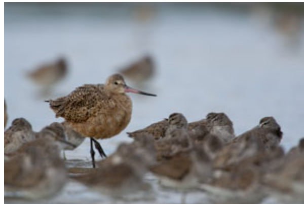
Marbled Godwit among shorebirds – Snake Bight, Everglades National Park

Leaving Anhinga Trail after a particularly late evening photographing, I saw the moon and the silhouette of one of the Royal Palms I had already photographed that evening at sunset. After several minutes of waiting, the moon, clouds, and wind cooperated allowing for this image to be made.