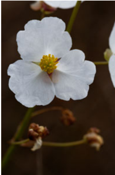
Lanceleaf Arrowhead – Everglades National Park

In both the morning and evenings, the reflections of the trees in the water provide some spectacular color. I love the soft colors in the reflection that are broken by the alligator's head.