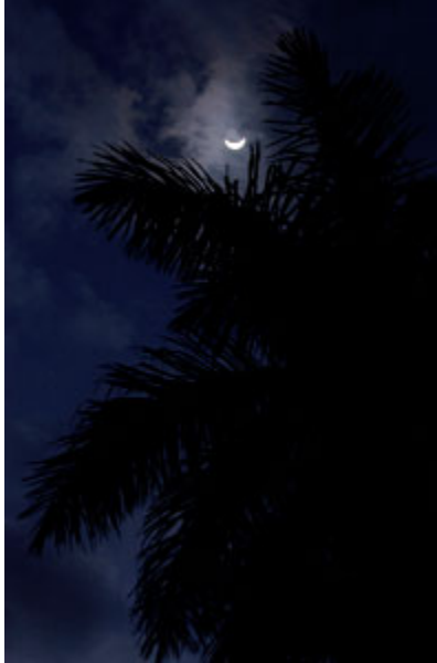
Crescent Moon above Royal Palm – Royal Palm, Everglades National Park

Leaving Anhinga Trail after a particularly late evening photographing, I saw the moon and the silhouette of one of the Royal Palms I had already photographed that evening at sunset. After several minutes of waiting, the moon, clouds, and wind cooperated allowing for this image to be made.